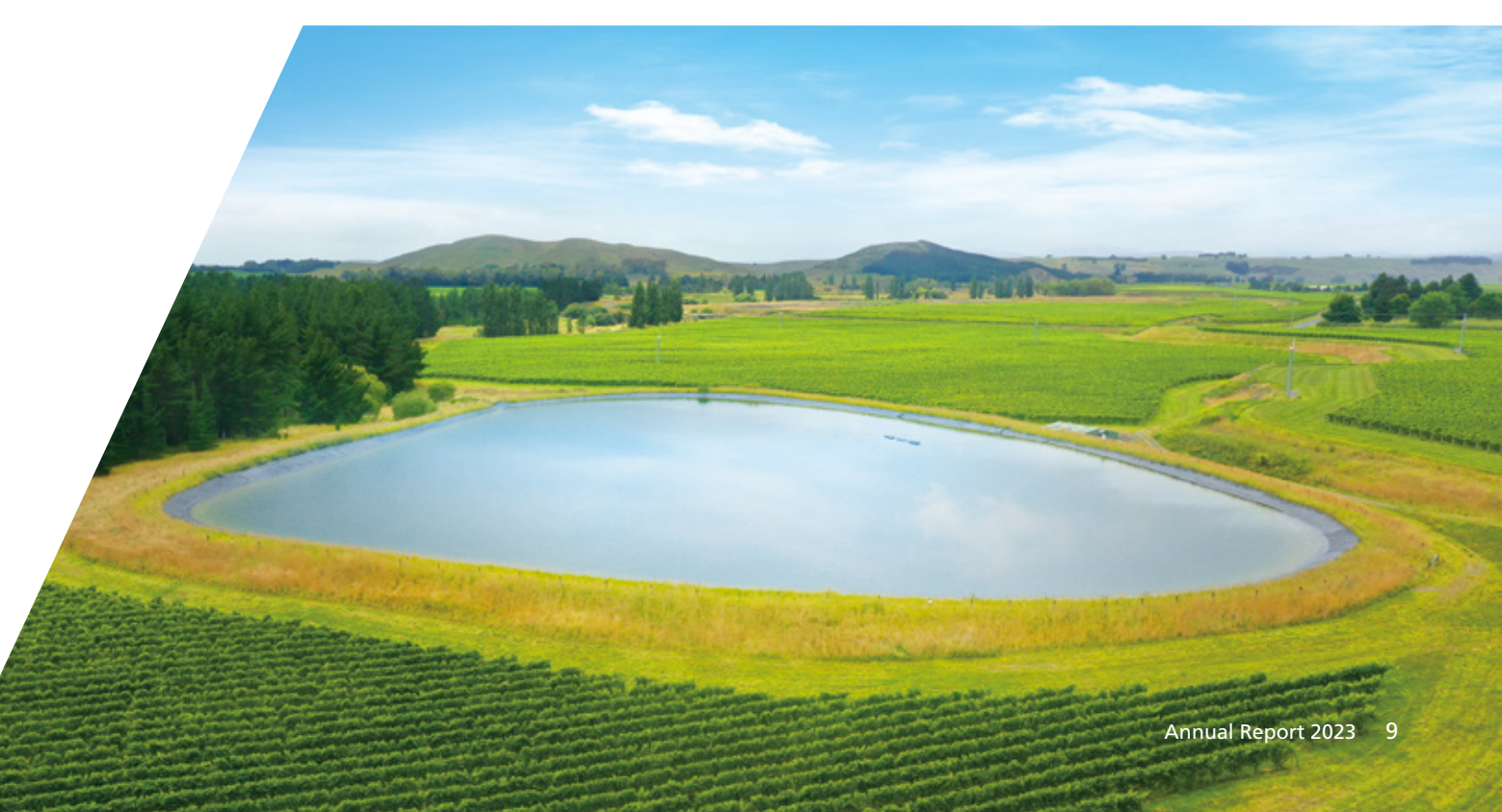
In 2023 CK Life Sciences renewed six of the vineyard leases across the portfolio with incumbent tenants, thus extending the weighted average lease expiry of the portfolio, enhancing the security of cash flow.