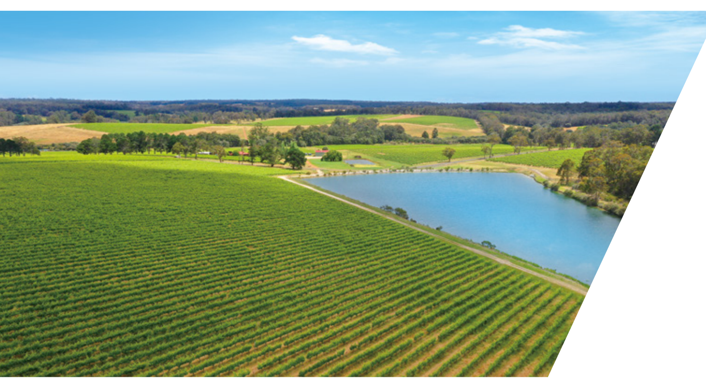
CK Life Sciences' vineyards in Australia and New Zealand are on long-term leases with wine companies or growers, generating steady and secure cash flow.

CK Life Sciences owns around 6,800 hectares of vineyards in Australia and New Zealand.